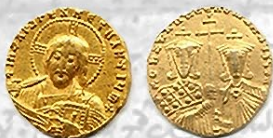
Serbian Association for Byzantine and Hellenic Studies