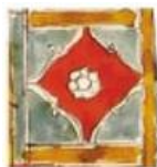
Moshe David Gaon Center for Ladino Culture

Faculty of Philosophy University of Belgrade